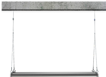
Aircraft Cable Mounting Kit (WH-ACC-AO-169) Comes standard with each Hyperion