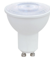
MR16 GU10 Base