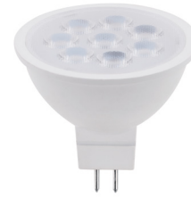
MR16 GU5.3 Base