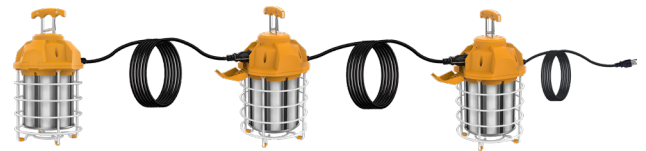
Linkable for use in single outlet