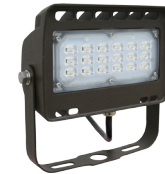
30W - yoke