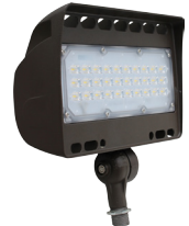
50W - knuckle