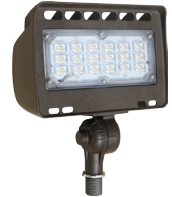
30W - knuckle