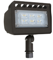
12W - knuckle